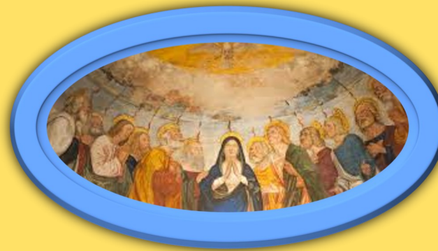
Our Lady with the Apostles and Disciples at Pentecost